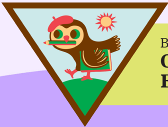
Based on the Outdoor Art Explorer Badge