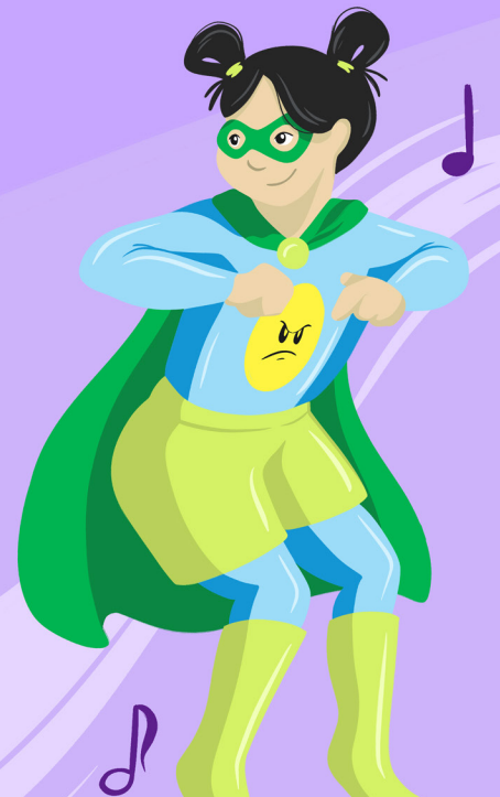
Based on the Dancer Badge