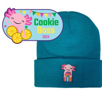
1,000-1,499 Packages Beanie Hat & Cookie Boss Yeti Mug and Patch