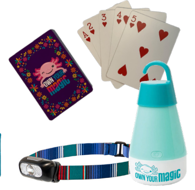
1,500-1,999 Packages Camp Light & Head Lamp & Playing Cards