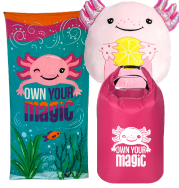
2,000-2,499 Packages Beach Towel & Dry Backpack & Axolotl Large Plush Pillow