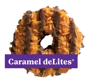
Crispy cookies topped with caramel, toasted coconut, and chocolaty stripes