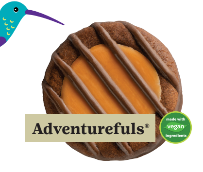
Indulgent brownie-inspired cookies with caramel flavored crème and a hint of sea salt