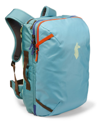
3,000-3,499 Packages Cotopaxi Allpa Travel Pack