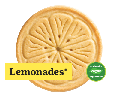
Savory slices of shortbread with a refreshingly tangy lemon flavored icing