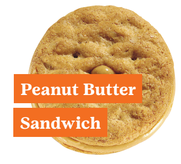
Crisp and crunchy oatmeal cookies with creamy peanut butter filling