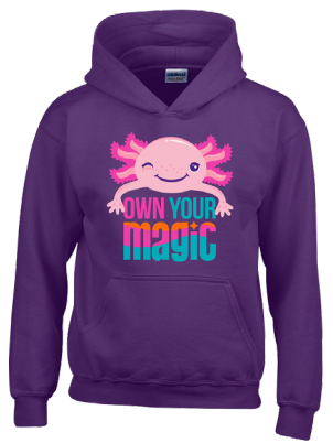
800-999 Packages Hoodie