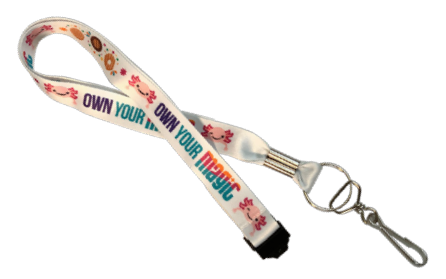
100-149 Packages Lanyard