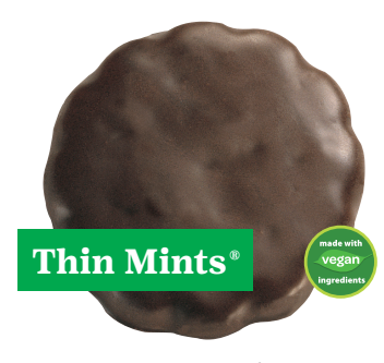
Crispy chocolate wafers dipped in a mint chocolaty coating