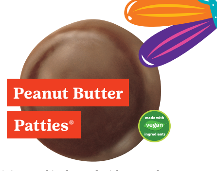
Crispy cookies layered with peanut butter and covered with a chocolaty coating