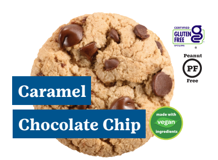
Caramel, semi-sweet chocolate chips, and a hint of sea salt in a delicious cookie* *Limited availability