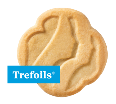
Iconic shortbread cookies inspired by the original Girl Scout recipe