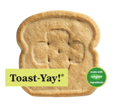
French Toast-inspired cookies dipped in delicious icing