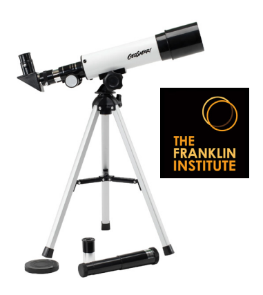
3,500-3,999 Packages Astronomy Package: Telescope, 4 tickets to Franklin Institute, Zoom with Astronomy Expert