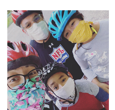
This is a photo of my family and me going for a bike ride on Wissahickon Forbidden Drive.