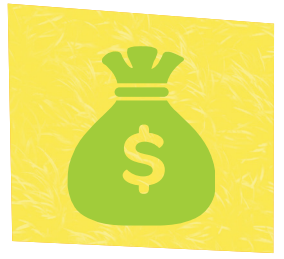
ENTREPRENEURSHIP The Girl Scout Cookie Program—the largest girl-led entrepreneurial program in the world— teaches goal setting, decision making, money management, business ethics, and people skills

Whether they complete Girl Scout Leadership Journeys, earn badges, run their own cookie business, pack for their first hike, change the world through Take Action projects, or any combination of these activities, at Girl Scouts, every girl has countless ways to explore our four program areas and hone the skills they'll need to power a lifetime of success—whatever that looks like for them.