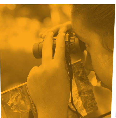
girl scouts of eastern pennsylvania