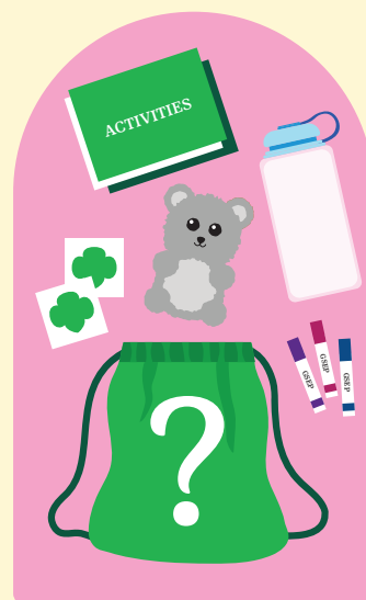
Ultimate Care Kit

Our Camp Care Kit contains a fun, colorable bag with fabric markers for autographs and more! Included are a camp tattoo and decal that will help them show their GSEP camp pride along with some fun activities to round out the camp care kit. Our Camp Care Kits start at $25!