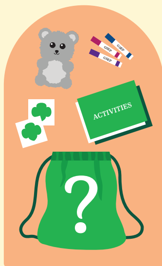
Plush Care Kit