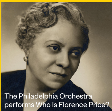
The Philadelphia Orchestra performs Who Is Florence Price?

Experience extraordinary performances while developing girl's leadership!