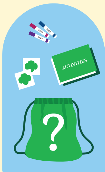
Camp Care Kit

Surprise your camper with a newly improved Camp Care Kit!