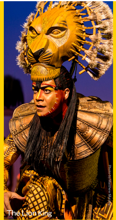
The Lion King