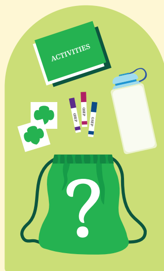
Hydrate Care Kit